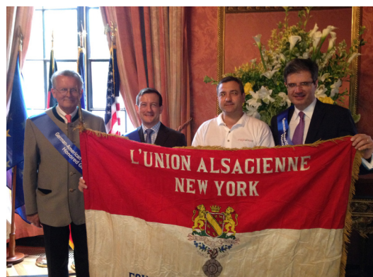
Consuls of Germany and France behind Alsace colours