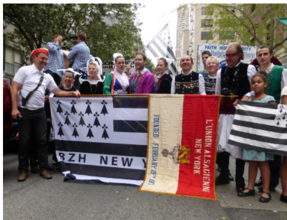
Alsatians and Bretons Power