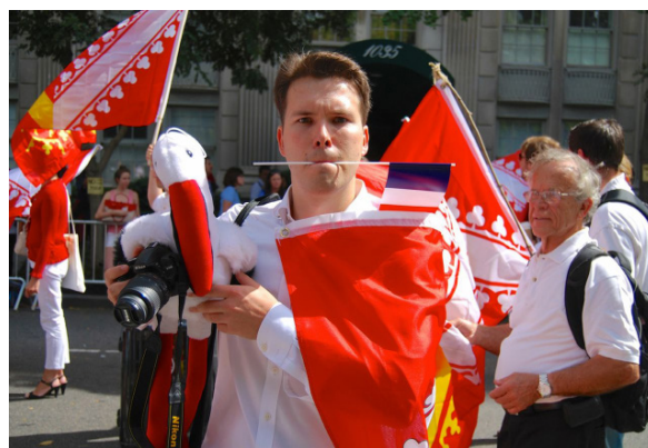
Storcky was there